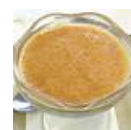
BABA DE CAMELO CARMEL MOUSSE